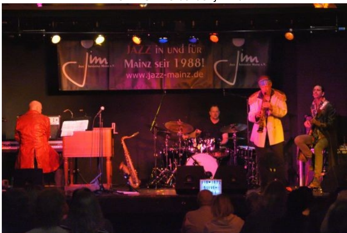
BILL EVANS ALLSTARS bei der JIM 2024:

Robben Ford/Bill Evans, “Blues, Miles and Beyond” with Keith Carlock and Darryl Jones is on schedule to perform at the Tokyo Bluenote, April 2023.